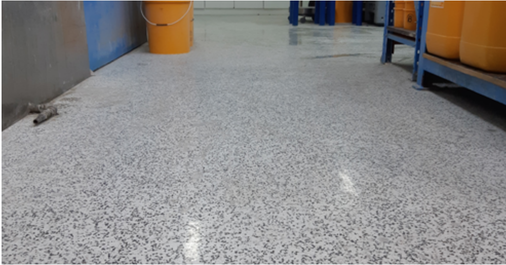
Riviera warehouse, UAE